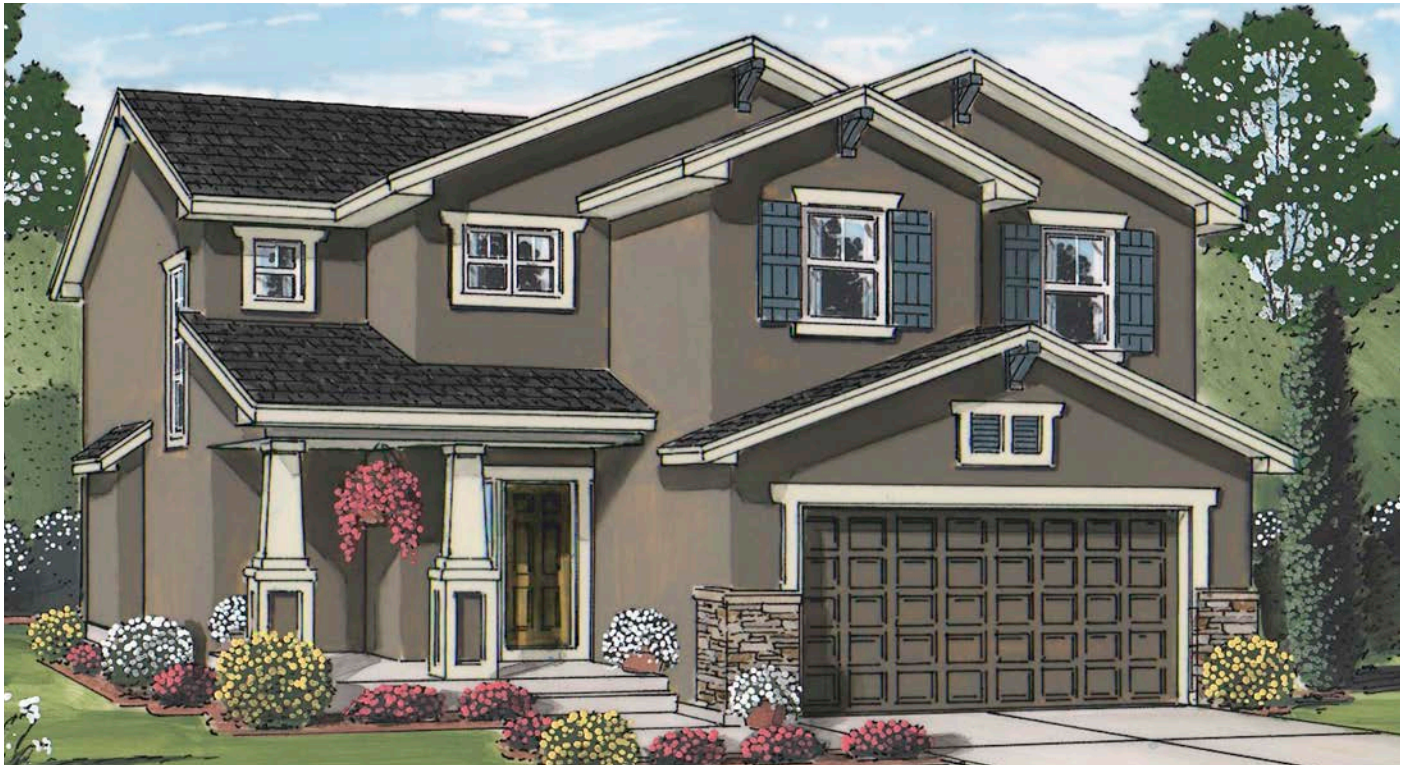
ELEVATION B SHOWN WITH OPTIONAL STUCCO