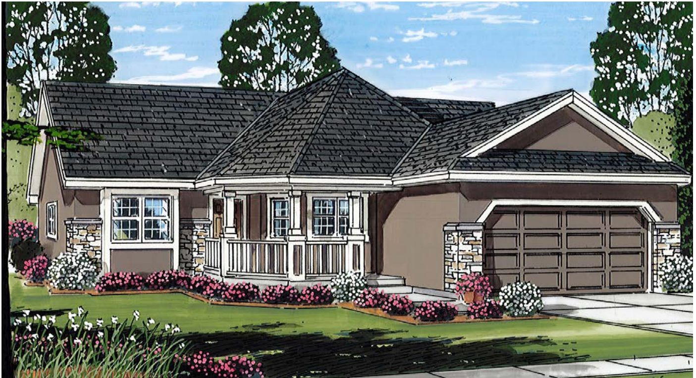
ELEVATION A (SHOWN WITH OPTIONAL STUCCO)